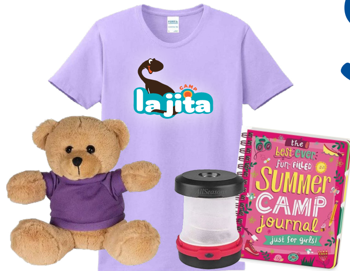
Images shown for illustration purposes only. Actual product may vary.