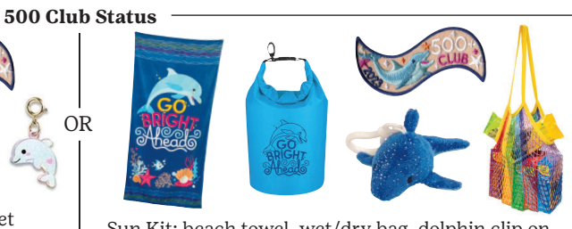
Sun Kit: beach towel, wet/dry bag, dolphin clip on, market tote AND for both 500 Club patch