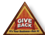
◀ BROWNIE GIVE BACK BADGE