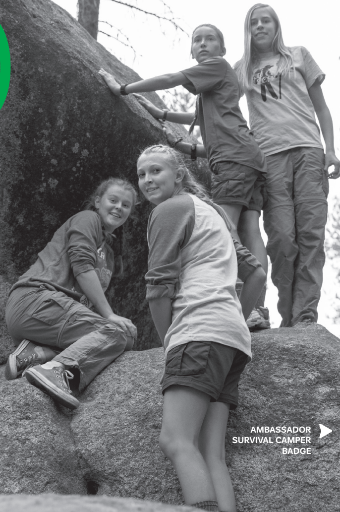
AMBASSADOR SURVIVAL CAMPER BADGE