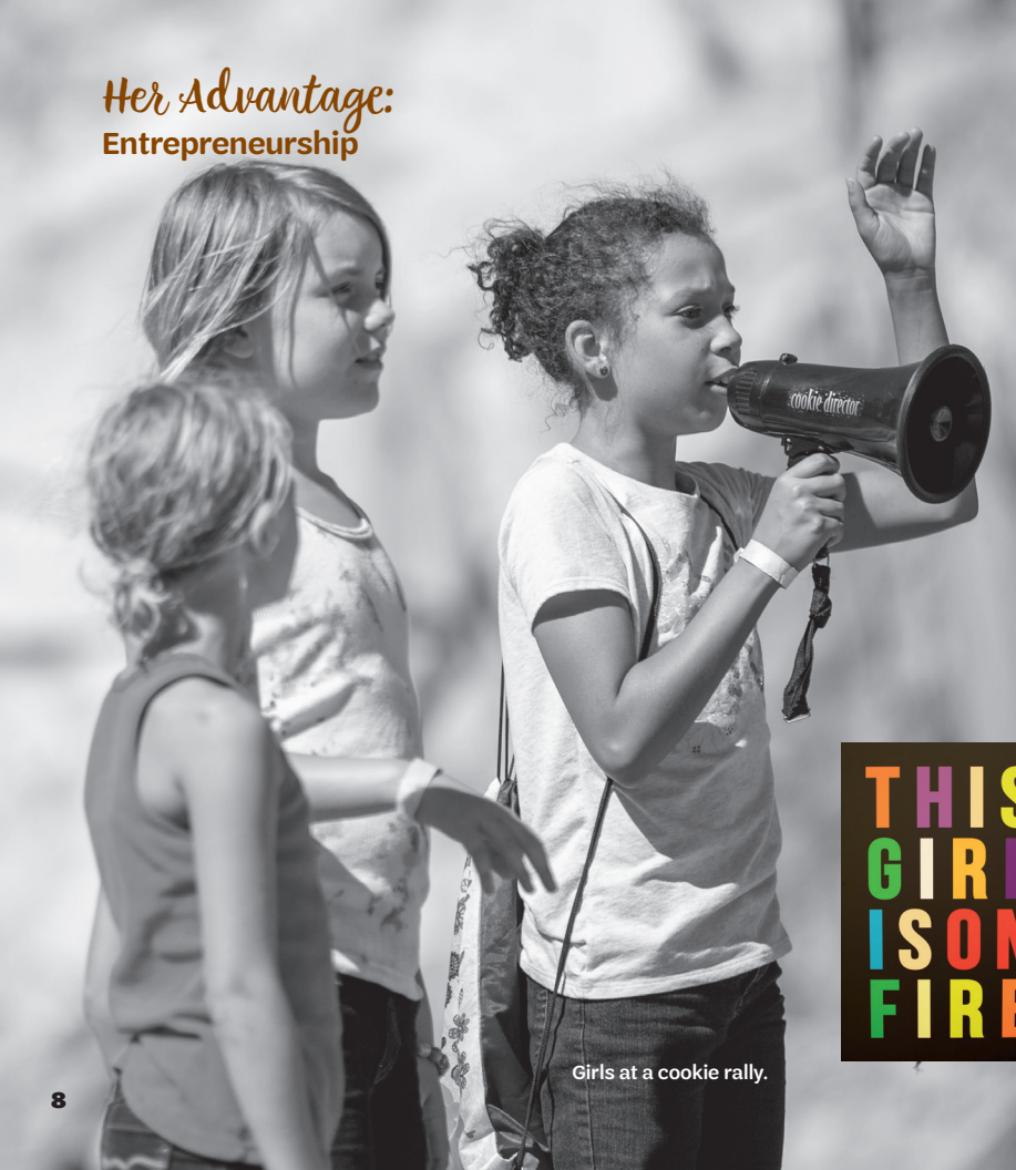
Girls at a cookie rally.