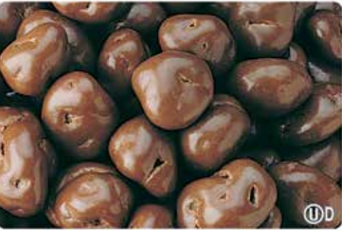
L Chocolate Covered Raisins $7 The plumpiest raisins covered in smooth milk chocolate. 10oz. Poptop Can