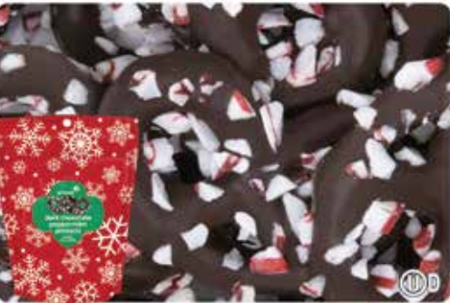
D Dark Chocolate Peppermint Pretzels $8 Crunchy pretzels coated in rich dark chocolate and sprinkled with peppermint pieces. 6.5oz. Bag