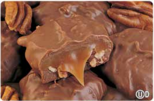
F Deluxe Pecan Clusters $8 Roasted pecans covered in caramel and milk chocolate. 5oz. Box