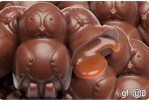
H Dulce de Leche Owls $7 Fresh, milky caramel surrounded by smooth milk chocolate. 5.1oz. Box