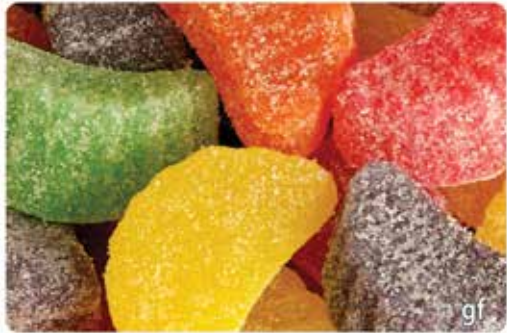
M Fruit Slices $6 Fat free! Assorted naturally & artificially fruit flavored chewy candy. 10.5oz. Bag