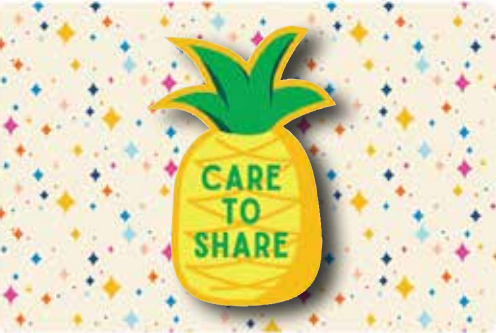
P Sweet Support Donation $6 Each $6 donation will donate one product to Operation Gratitude.

☪ = Kosher ☪☪ = Kosher, Dairy gf = Naturally Gluten Free *CAUTION: ALL products processed on shared equipment with peanut and tree nut containing products.