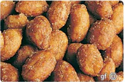
O Honey Roasted Peanuts $6 Peanuts roasted with a touch of honey. 9oz. Poptop Can