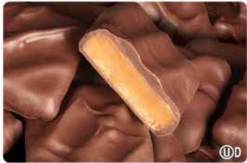
E English Butter Toffee $8 Crunchy handcrafted toffee drenched in milk chocolate. 6oz. Box