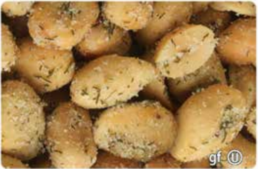
N Dill Pickle Flavored Peanuts $6 Crunchy peanuts with an irresistible dill pickle flavor. 9oz. Poptop Can