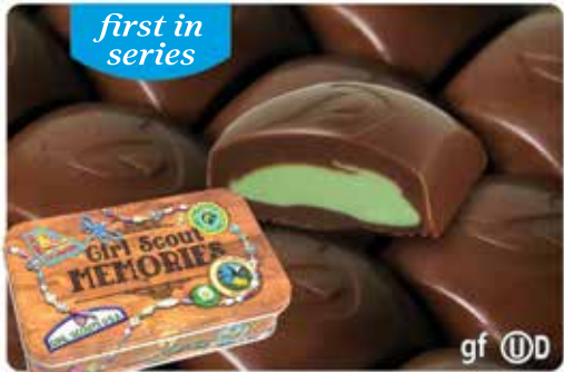
A Mint Treasures w/ GS Memory Box Tin $11 Creamy milk chocolate with a refreshing mint filled center. 6oz. Tin