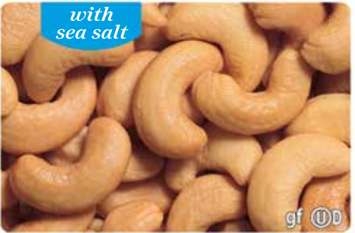
C Whole Cashews $9 A classic favorite roasted and salted with sea salt. 8oz. Poptop Can