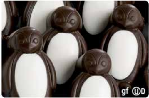
I Dark Chocolate Mint Penguins $7 Rich dark chocolate penguins bursting with frosty mint. 6oz. Box