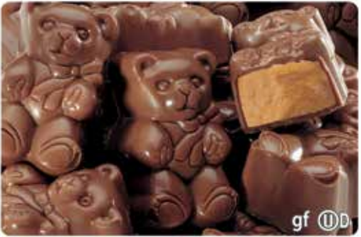
J Peanut Butter Bears $7 Milk chocolate bears with a smooth peanut butter filling. 6oz. Box