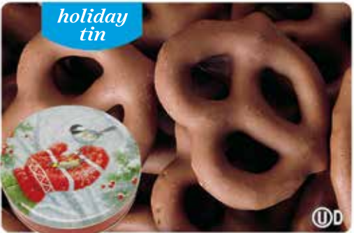
B Chocolate Covered Pretzels w/ Mitten Tin $10 A favorite sweet and salty snack. Crunchy pretzels covered in smooth milk chocolate. 6.5oz. Tin