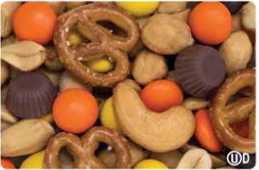
K Peanut Butter Trail Mix $7 Peanuts, peanut butter gems, peanut butter mini cups, mini pretzels and cashews. 7oz. Bag