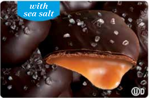
G Dark Chocolate Caramel Caps w/ Sea Salt $8 Dark chocolate covered caramel topped with sea salt. 6oz. Box