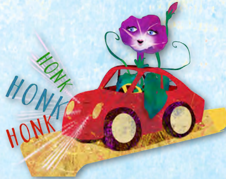
Car horn honking