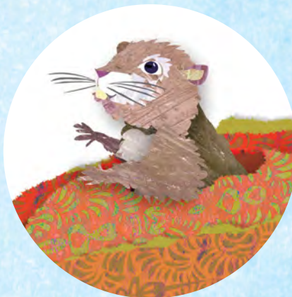
Squirrel or chipmunk chattering