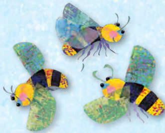
Insect buzzing or humming

Circle all of the sounds you hear. If you hear a sound that's not on the page, write it down or draw a picture!