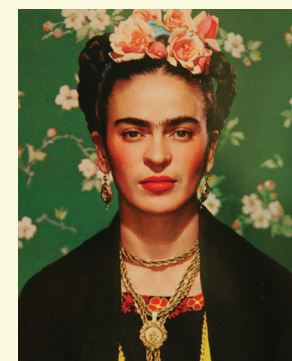
Frida Kahlo (1907–1954) was the first Mexican artist to have a painting at the famous Louvre museum, in Paris, France.