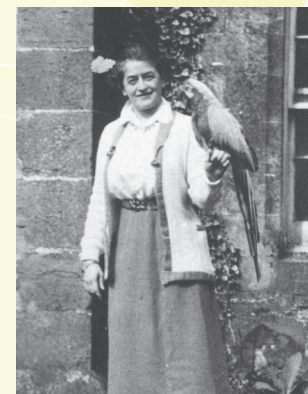
Juliette Gordon Low (1860–1927) founded the Girl Scouts of the USA.