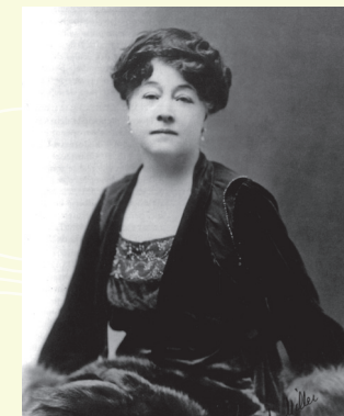
Alice Guy-Blaché (1873–1968) was a Frenchwoman and the first female director in the movie industry.