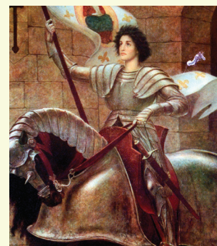
Joan of Arc (1412–1431) helped the French defeat the English in the Hundred Years War.