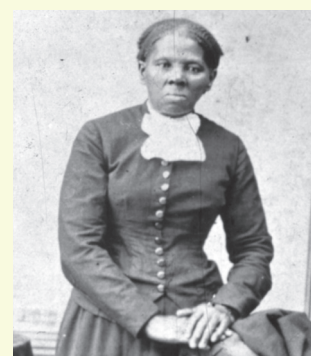
Harriet Tubman (1821–1913) was an escaped slave who helped more than 70 other slaves make their way to freedom through the Underground Railroad.