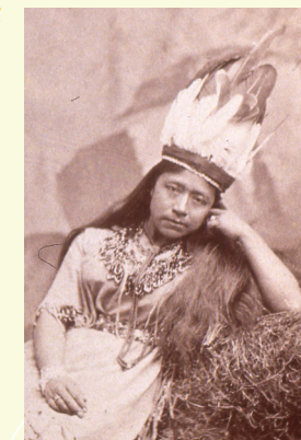
Sarah Winnemucca (1841–1891) was the first American Indian woman to publish a book in English.