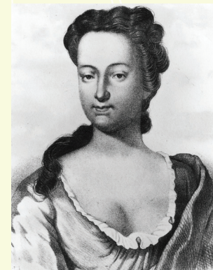
Elizabeth Blackwell (1821–1910) was the first female physician in the United States.