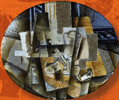
Untitled , 1981 Artist Hannelore Baron used scraps of paper, cloth, string, wire, and wood to create her collages.