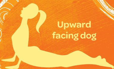
Upward facing dog