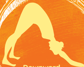
Downward facing dog