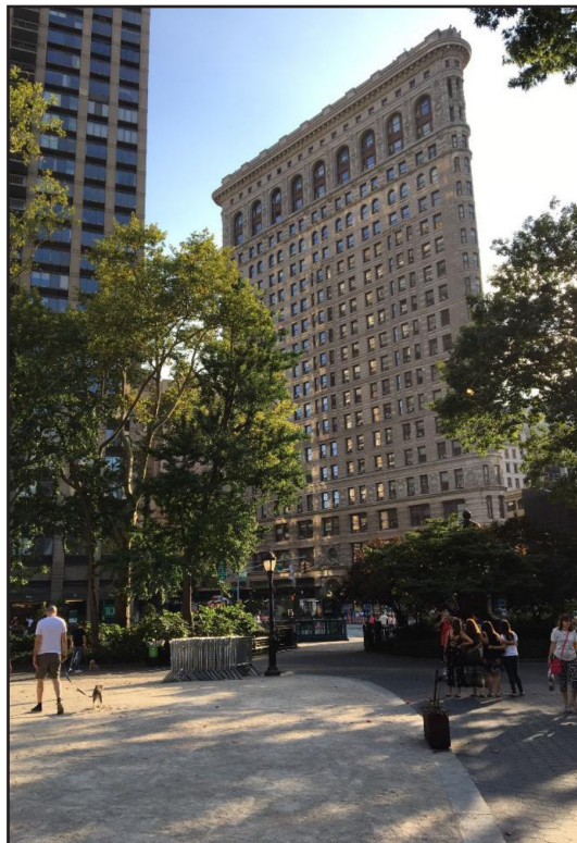
Sample Photos Front B