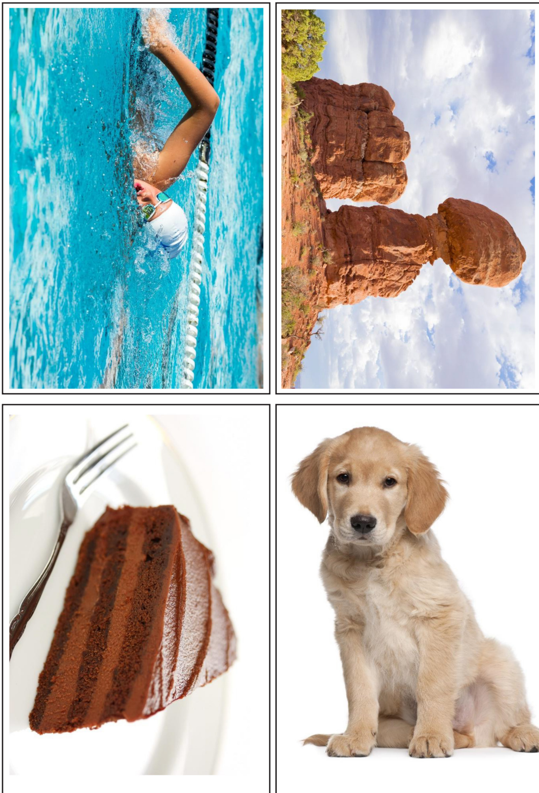
Sample Photos Front A