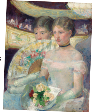
↑ Mary Cassatt The Loge (1878-1880)

Figurative Art is a kind of representational art. It shows people and objects realistically or similar to how they look in the real world. It often focuses on human bodies in a recognizable way.