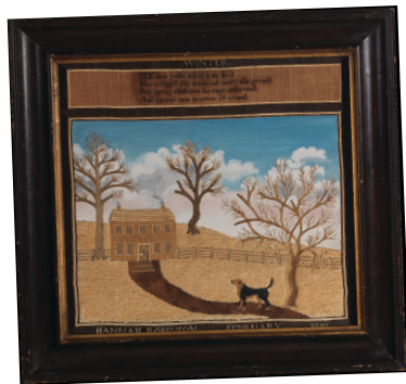
→ Hannah Robinson Winter (1819) Needlework Picture

Abstract Expressionism uses colors, lines, and shapes to capture a feeling or emotional reaction. It values creating art without a plan and doesn't have a recognizable subject.