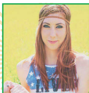
Chelsea Baldwin Teen Suicide Prevention