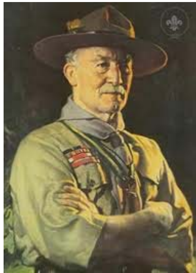
Lord Baden Powell